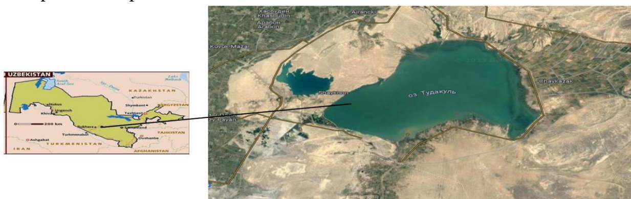
Fig. 1. Tudakul reservoir and it's location in Uzbekistan