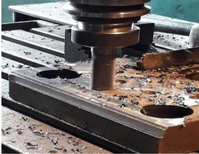
Figure 3: Detail separation process during machining.

When cutting titanium alloys, it is characterized by the formation of flakes in the form of novs (Fig. 3).