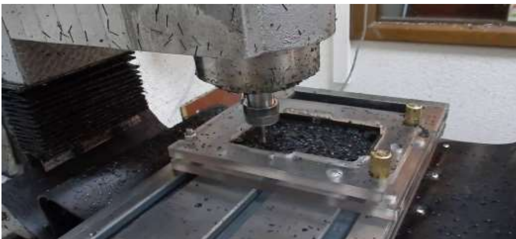
Figure 1: Finger milling on hard-to-handle materials milling using.

The positive combination of titanium-based alloys, one of the most difficult-to-process materials, has ensured their widespread use in aerospace, shipbuilding and instrumentation, chemical engineering, and a number of industries. Alloys of difficult-to-work materials are superior to alloys of aluminum, nickel and iron in terms of relative strength. The plastic properties of titanium alloys are lower than those of iron and nickel-based alloys. Compared to these materials, titanium alloys have a much lower modulus of elasticity, which is prone to elastic deformation during cutting. Titanium alloys have a heat resistance of 500-600 ° C and corrosion resistance to many harmful environments. [2]